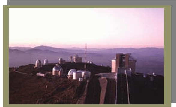
Mauna Kea Observatory

Earth-based observatories will be used for observations from Earth. The best case scenario would mean that the impact would take place when the comet is visible through the telescopes of more than one major observatory. Earth-based observing of the impact is a secondary source of data. Earth-based viewing allows scientists to observe the characteristics of the comet nucleus before impact. The types of observation from the Earth includes optical and infrared imaging, optical and infrared spectroscopy, and x-ray, optical, infrared and far infrared photometry.